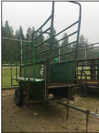
Unit A06 (wooden floor)