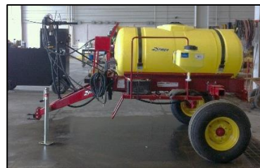
Units A34 & A58